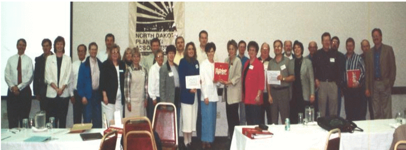
The Survivors from the Planning Made Easy class!